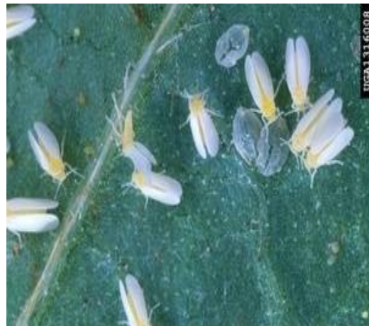
White fly of soybean

Yellow Mosaic Virus: This disease was prevalent in Himachal Pradesh, Delhi, Punjab, Haryana, and parts of M.P. However, during recent years it is heavily infested on soybean crop prevalent in Central Zone covering Madhya Pradesh, Maharashtra and Rajasthan leading to heavy losses to farmers. This disease is virus transmitted and has a wide host range which includes pulses and weeds. It causes 15-75% yield loss.