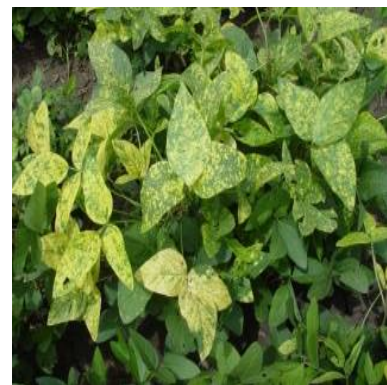
Yellow mosaic virus in soybean

Symptoms: Yellow spots are either scattered or produced in indefinite bands along the major veins of soybean leaves. Rusty necrotic spots appear in the yellow areas as the leaves mature. Some time severe mottling and crinkling of leaves are also seen. Leaves of severely infected